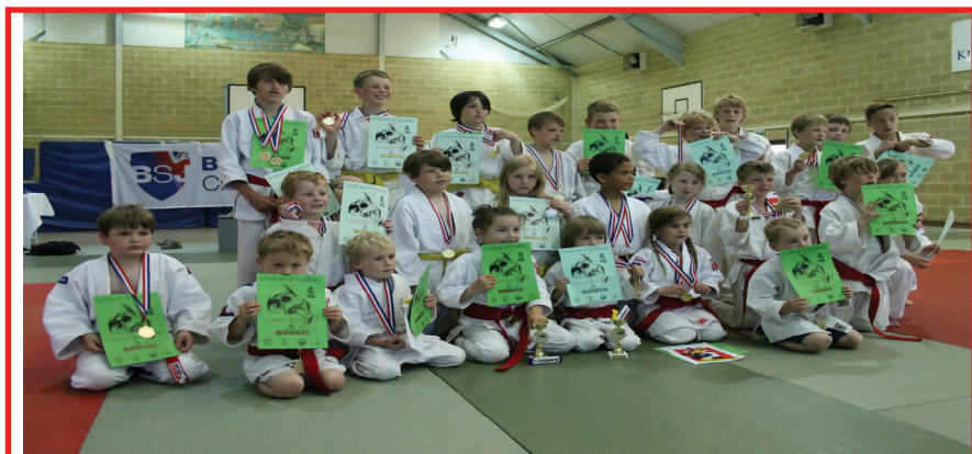
Current Top Four In Kingsley School Judo League Festival