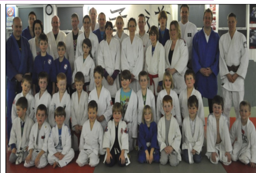
Kingsley School Judo Club Parents Night

How Many Medals Will Germany Win in Judo at Olympics— More