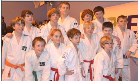
Kingsley Judo Club At Devon Championships